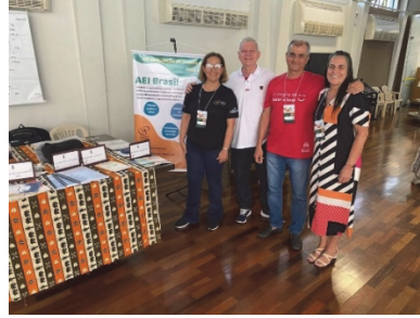
Missionary Conference of Primeira church Presbyterian in Belo Horizonte