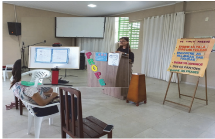
Training in the city of Correntes state Pernambuco