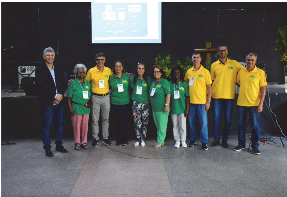
Equipe Missão AEI/Brasil – MEMBER NATION GATHERING 2023 – BRASIL