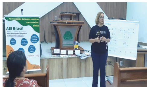
Representing Mission AEI at the meeting - GAM/SEXTA IGREJA