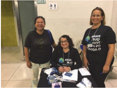
Course Perspectivas representing Mission AEI.