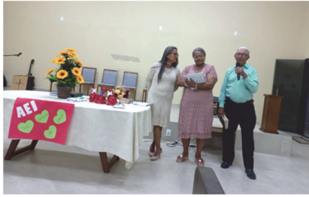
Classroom in the city of Lagoa do Ouro, State Pernambuco.