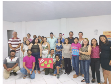
Training in the city of Custodia state Pernambuco