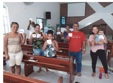
Course TPA and city of Coronel Fabriciano