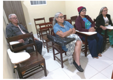
Graduation of AEE students – November