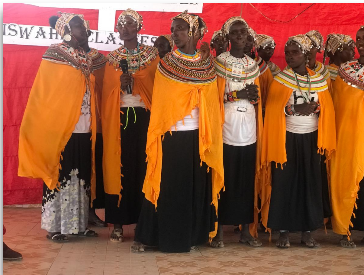
Class of 2022 in Rendille and Swahili

Sharing the love of Jesus Christ through the gift of reading in English and local languages