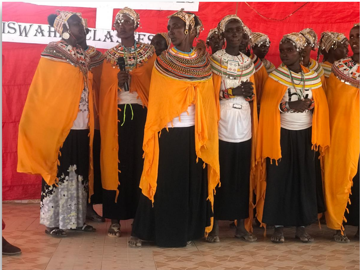
Class of 2022 in Rendille and Swahili

Sharing the love of Jesus Christ through the gift of reading in English and local languages