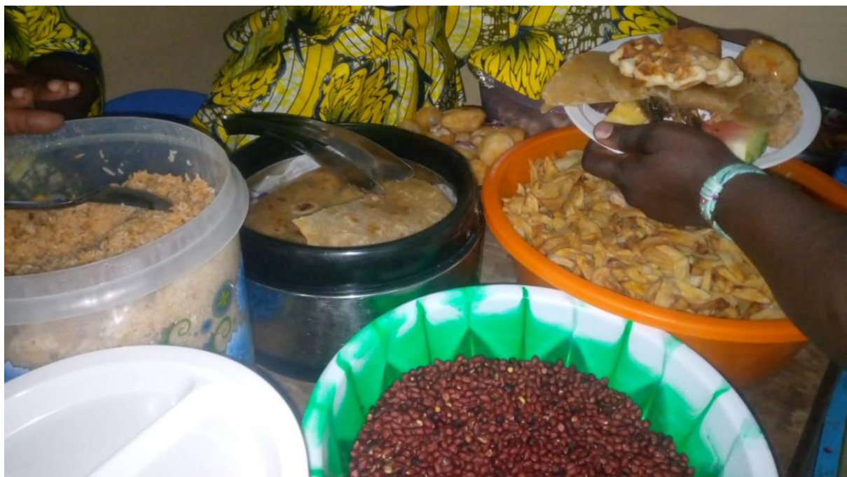
Foods prepared by the cookery class students.

Currently there are three skills open to them: Dress making, Cookery and Beauty and Cosmetics. L&E Kenya provides the teacher and the ESL materials. We also mobilize local resources for the skills training program. Learners are examined and receive certificates from central government