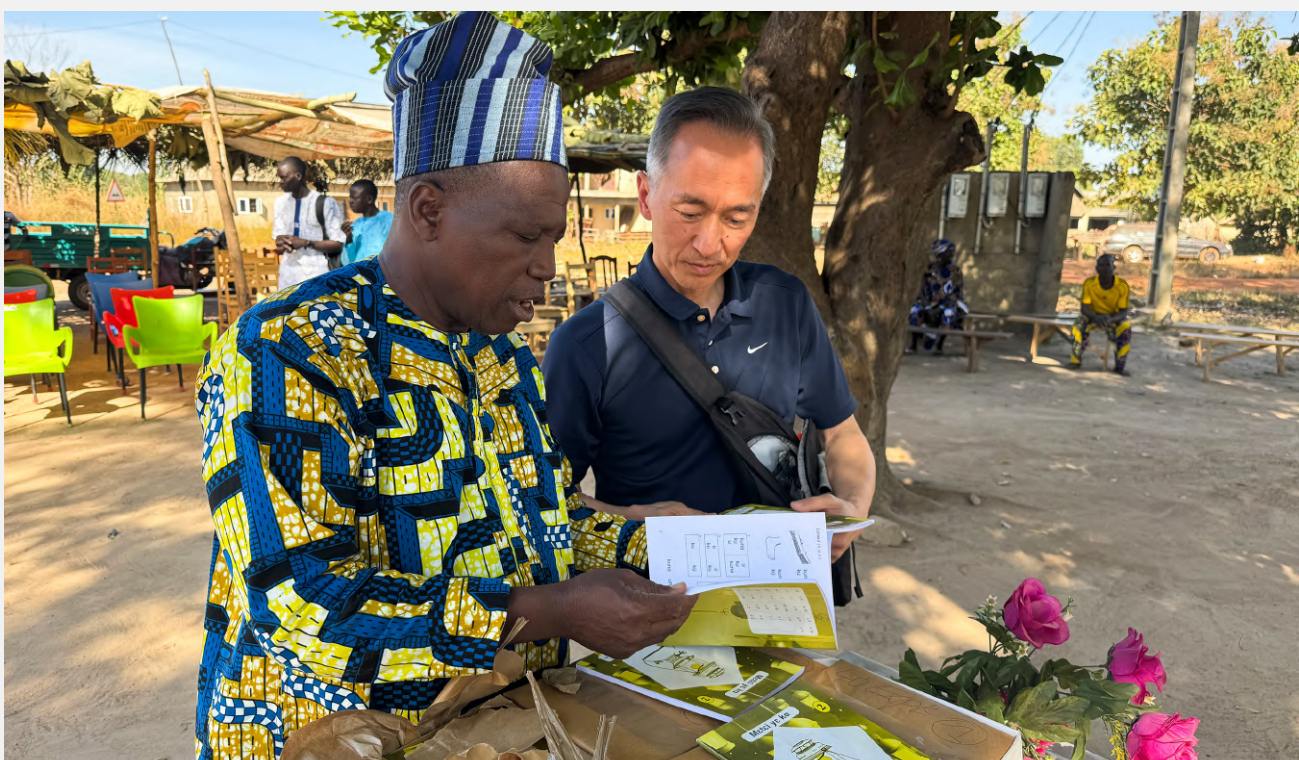
Launch of the primers and its mobile application in the Sola language

The Primers developed in 2022 went into print production, while a mobile application dedicated to Book 1 was also successfully developed. This joint deployment is a major achievement for our program. Both face-to-face and online courses continue uninterrupted. We are deeply grateful for your continued support through your prayers, which bring comfort and strength to learners and teachers alike.