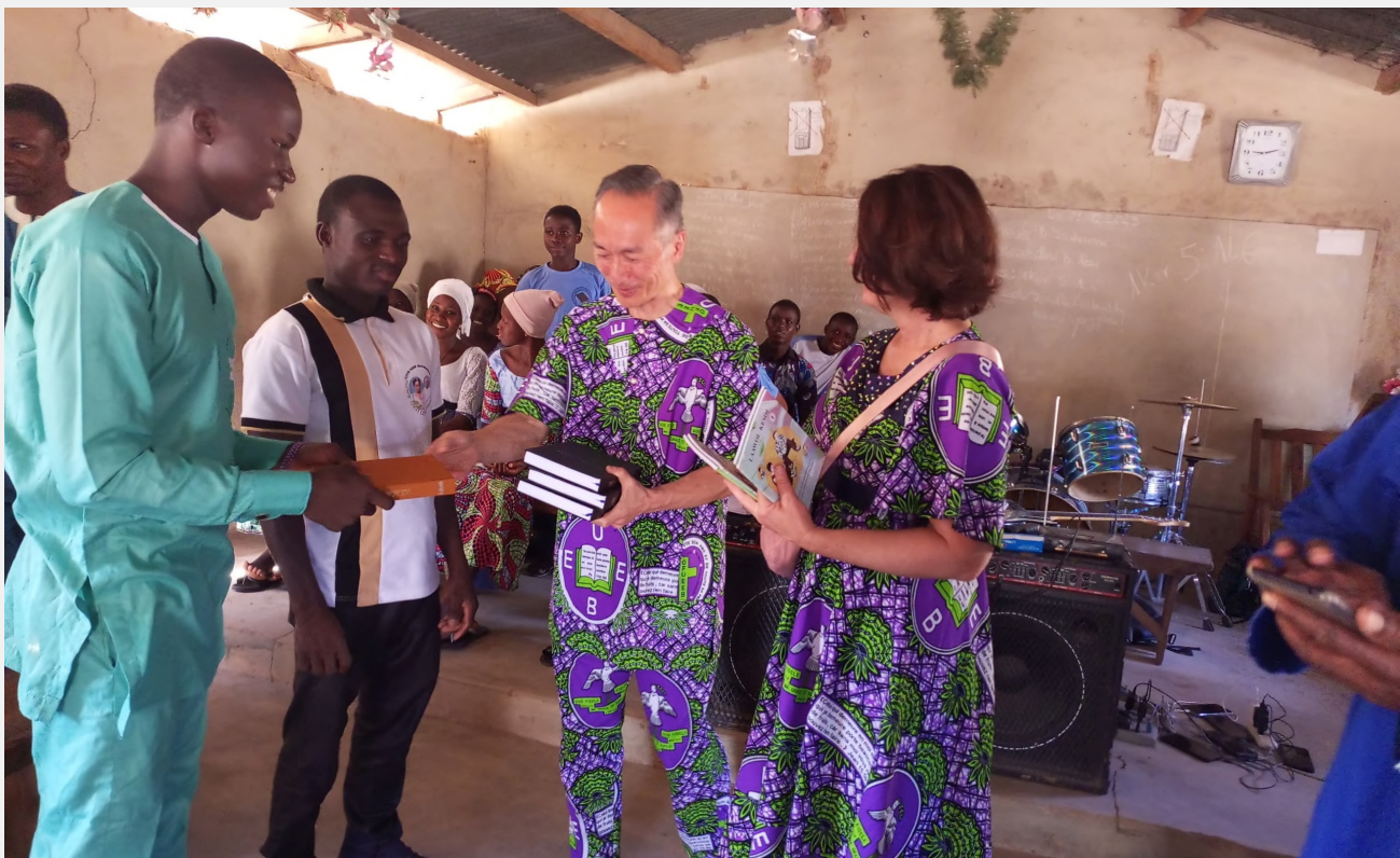
Distribution of New Testaments in the Fulani language at Soumon