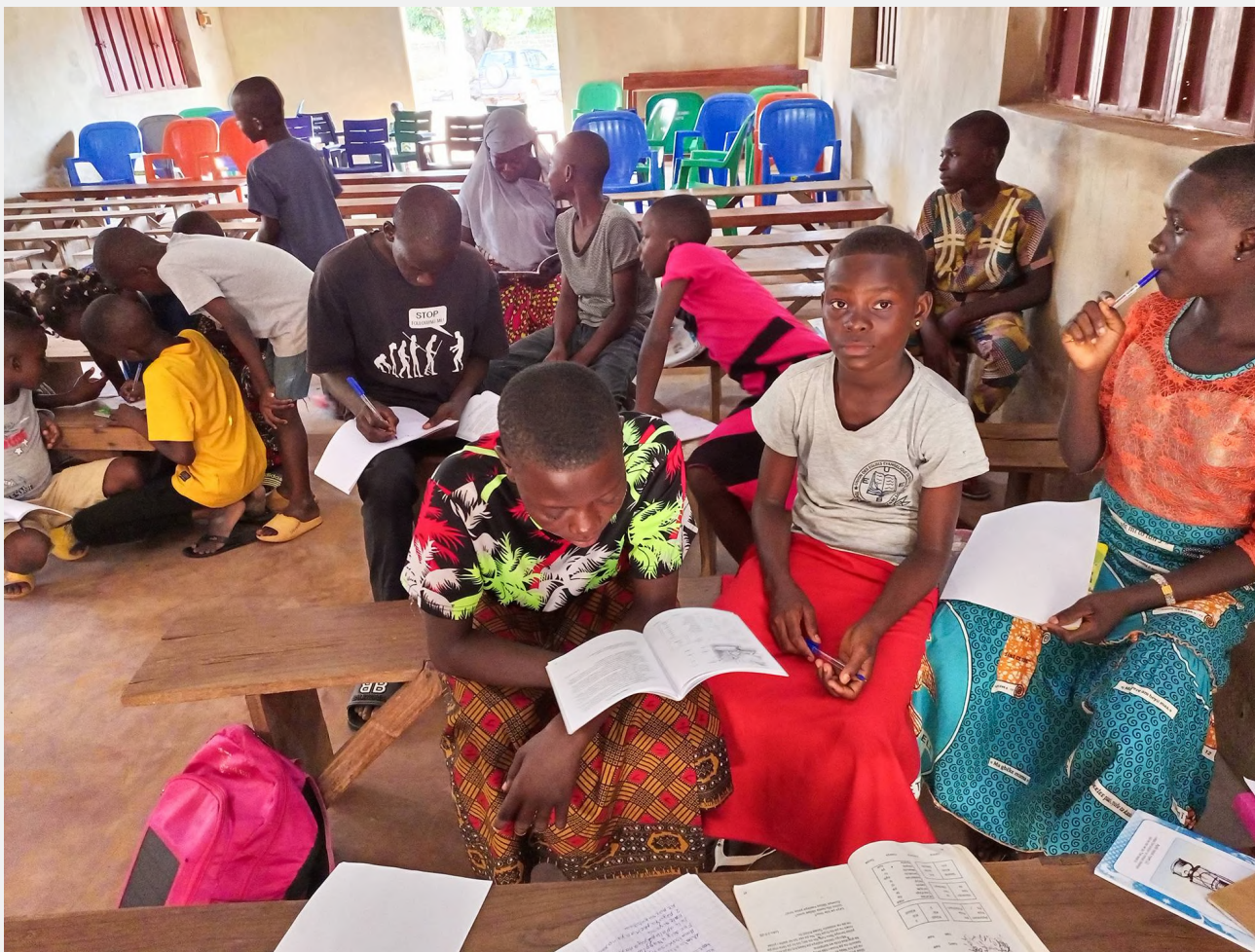
Literacy classes for children during the school vacations