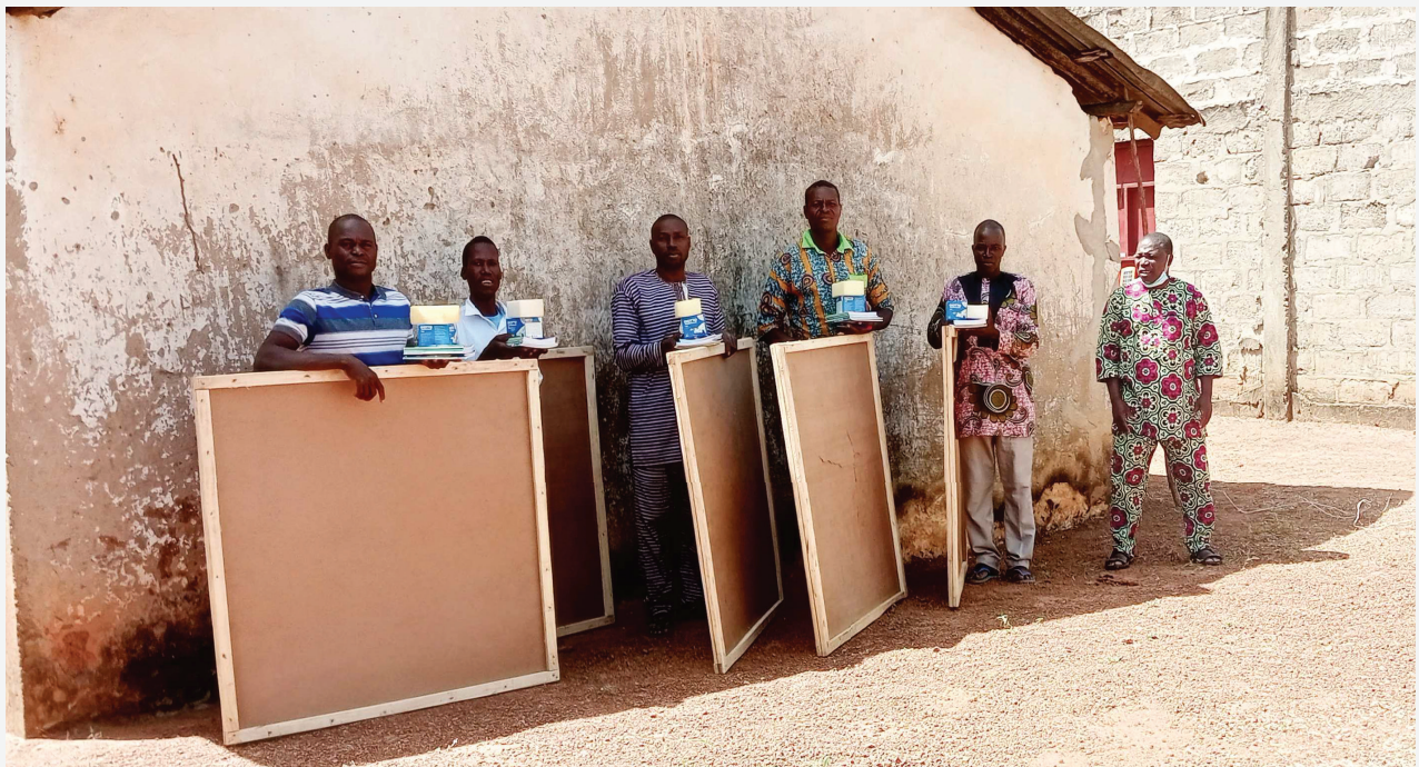
Donation of literacy kits, Bethlehem, May 2024