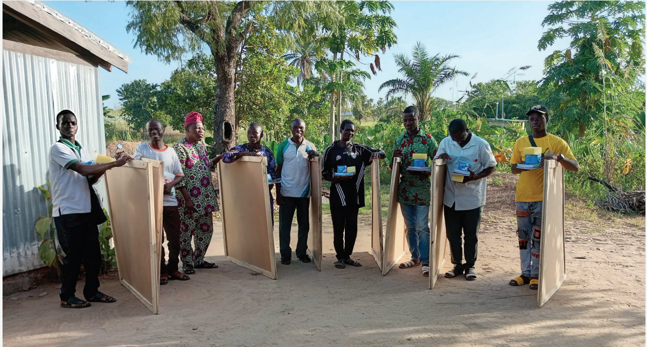
Donation of literacy kits, Bougou, May 2024