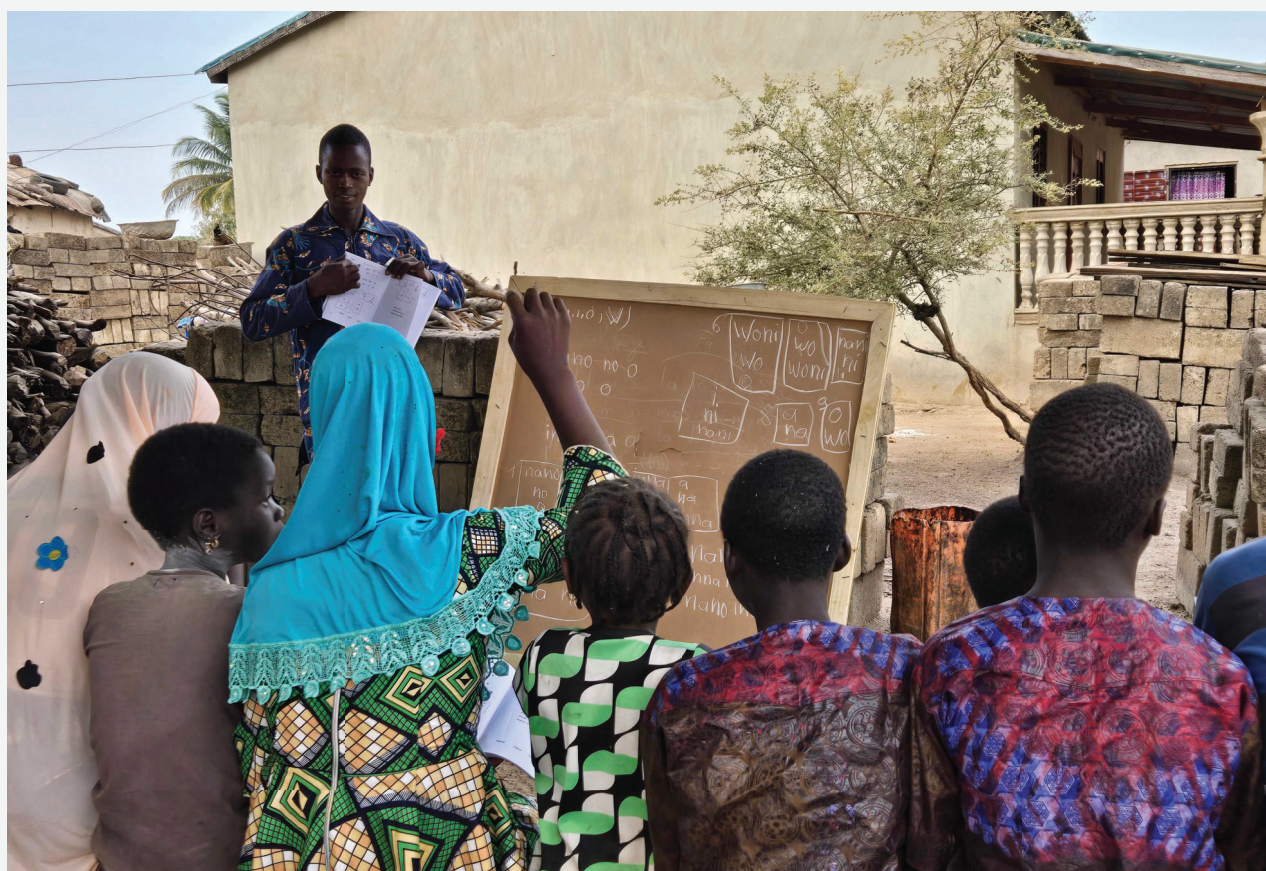
Fulani Literacy classes for Muslims in Bougou, December 2024