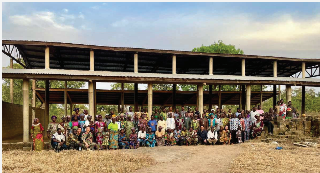
Training for pastors, Conference of pastors' wives and medical mission, Gaounga, December 2024