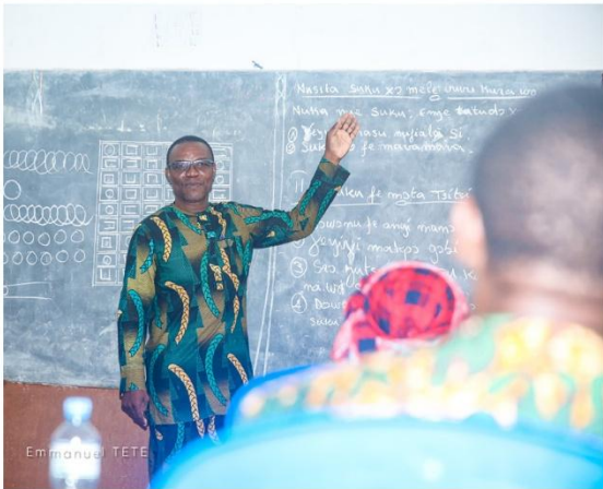
The National Director facing the trained teachers during the refresher workshop

Through the teacher census initiative, LID TOGO successfully identified 42 teachers who had previously undergone training. These individuals were encouraged to resume their roles in the education sector, contributing their experience and skills to strengthen the quality of teaching. This effort not only supported the reintegration of trained educators but also aimed to address gaps in the teaching workforce across communities.