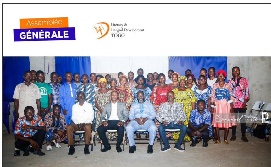
General Assembly: Held on October 12, 2024, with 38 participants

LID TOGO's National Director continued professional development with focused training in the concept of Member Nation, fundraising strategies, and leadership. At the same time, the organization enhanced its monitoring system by introducing Google Forms to collect and manage data on teachers, learners, and literacy cen-