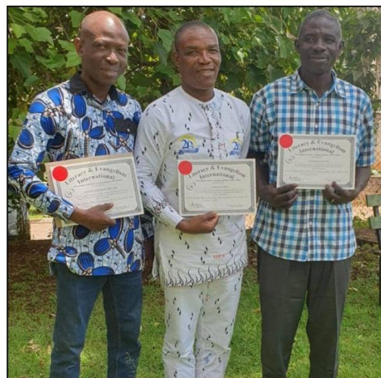
Trainer of trainers workshop: The National Director and his two coordinators attended a training of trainers in Nairobi from October 15th to 30th, 2024.