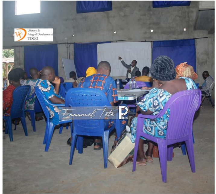
The trainers listening to the National Director explanation during a meeting

In a renewed push to strengthen community education, 12 previously trained teachers took part in a refresher workshop organized by LID TOGO in Baguida on July 27, 2024. The one-day session focused on reinforcing core teaching techniques and re-engaging educators in the field. As a direct result, three participants have already reopened their literacy centers, signaling a promising revival of grassroots educational efforts in the region.