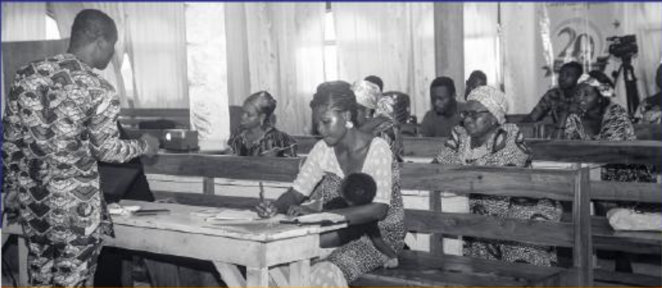
A session of teachers training