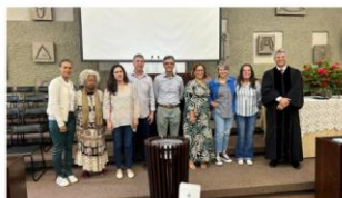
30th Anniversary - AEI Brasil