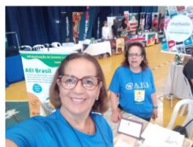
41st Word of Life Congress