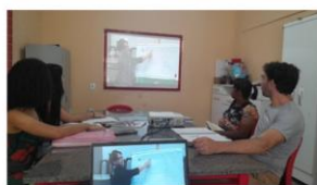
Tutor Training - Laje/BA