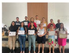
Tutor Training - Cuparaque/MG