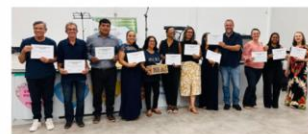
Tutor Training - Canarana/MT