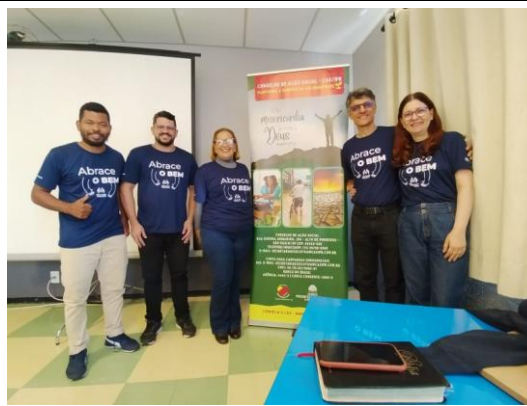
ASPACAM/AEI Brazil Team

The meeting aimed to share experiences, in addition to bringing topics of interest to Social Projects, aiming to improve the management of institutions and produce greater engagement of churches and the public served.