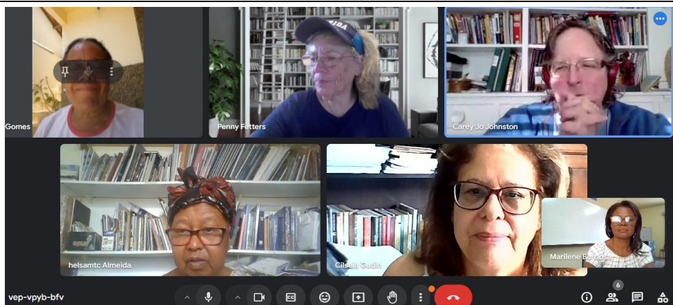
Online Meeting - Primer Construction Team (participation of consultants from the USA and Canada)

In 2024, the work of developing the primer for the new ethnicity continued its course with weekly online meetings on Tuesdays and Thursdays, with the support of LEI advisors from the United States and Canada. The primer has been completed and now needs to be reviewed by a native translator, which is the great challenge for the year 2025.