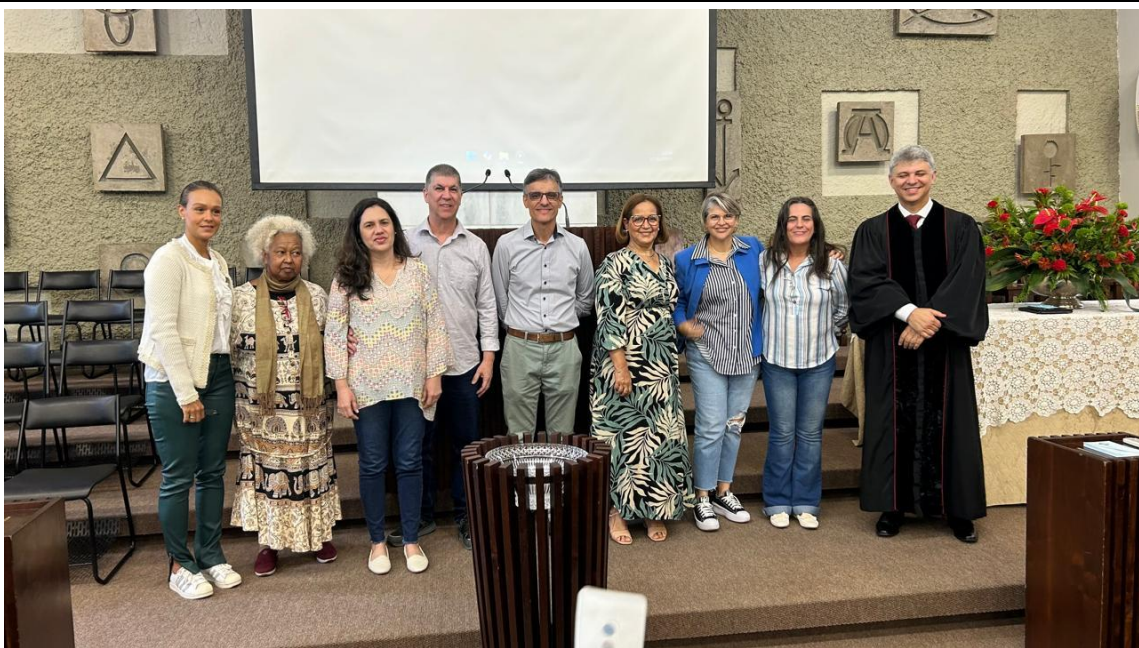
Moment of Gratitude for the 30th anniversary of AEI Brasil

In Brazil, the work continued under the coordination of several brothers, culminating in the training of about five thousand teachers, three hundred coordinators and hundreds of literate students during these thirty years of ministry.