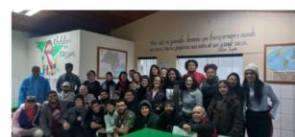
Tutor Training - Kairós Mission/SP