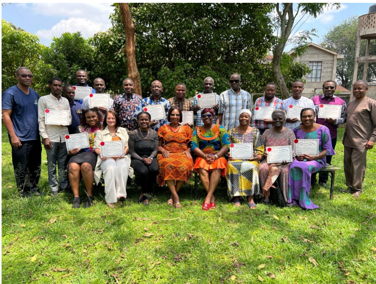
The graduands of the Africa Region Literacy Training Institute, Nairobi 2024

Sharing the love of Jesus Christ through the gift of reading in English and local languages