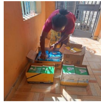
Some of the beneficiaries of free Bibles and primers