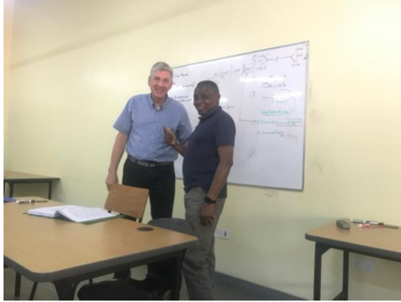
Lutheran Theological Seminary, Kimuka

These partnerships are vital for creating awareness for the great need for literacy as a tool for church planting, evangelism and discipleship