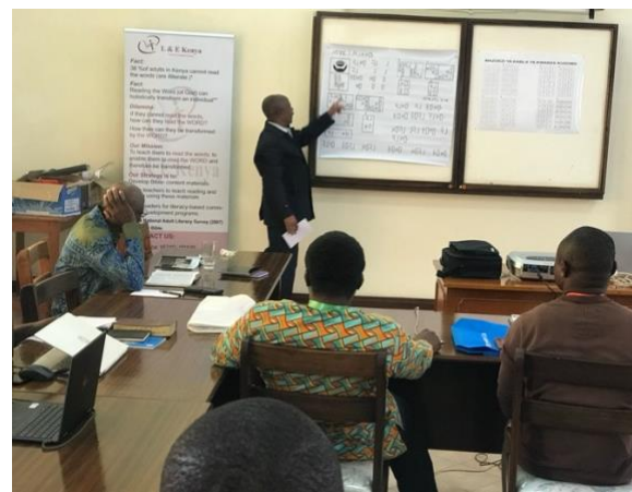
Using a lesson chart in a workshop