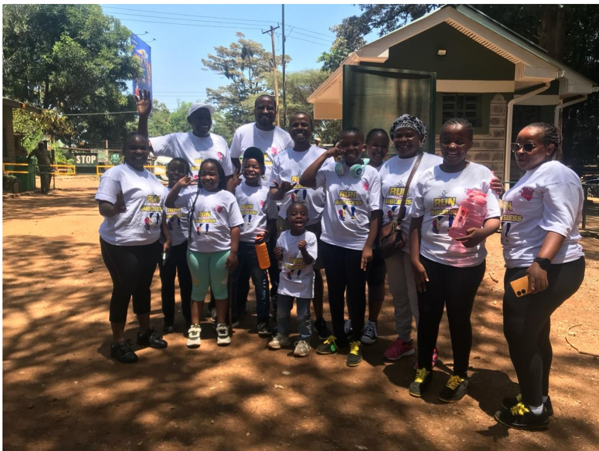
Part of Team L&E at the Run for the Bibleless March 15, 2024 .

Each A1size lesson chart contains 25 full lessons and is very convenient for teaching large literacy classes.