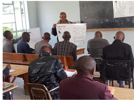
Africa Inland Church College, Narok