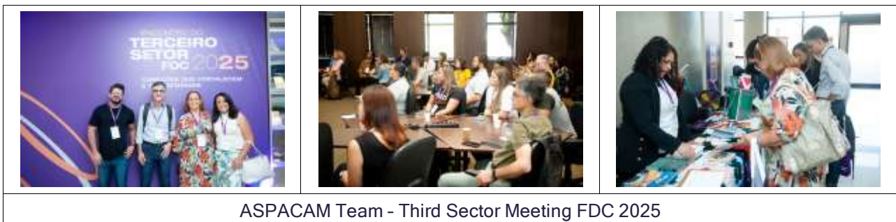
ASPACAM Team - Third Sector Meeting FDC 2025

ASPACAM participated in the FDC 2025 Third Sector Meeting, promoted by the Dom Cabral Foundation. It was a rich opportunity for exchange with various institutions from all over the country, as well as for learning from the presentations made during the event. ASPACAM was represented by collaborators from CRC, AEI Brasil, the administrative area of the headquarters, and the Executive Board.