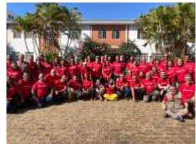
Regional Meeting of Leaders and Managers of Social Projects of CAS/IPB - Campinas/SP