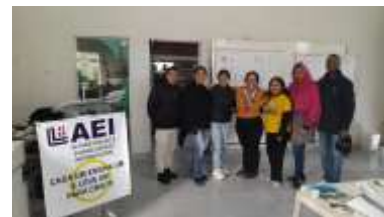
Kairós Mission - São Paulo/SP