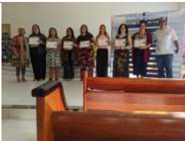
Tutor Training - Igreja Ev. Cong. Recanto do Magarça - Guaratiba/RJ