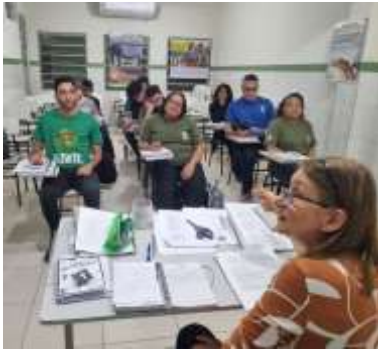
Tutor Training - IBN - Garanhuns/PE

Of note is the insertion of the Tutor Training in the curriculum of the Instituto Bíblico do Norte - IBN (North Bible Institute), in Garanhuns/PE, from the 2nd semester, providing to missionaries and evangelists the ability to teach adults to read and write with biblical content, using the methodology of Literacy & Evangelism International - LEI.