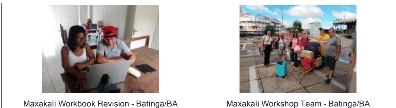
Maxakali Workbook Revision - Batinga/BA