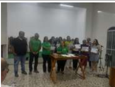
Tutor Training - Jequié/BA