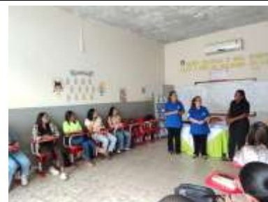
Tutor Training - Laje/BA