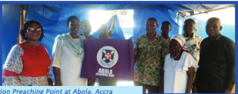
Visit to PCG Resurrection Preaching Point at Abola, Accra