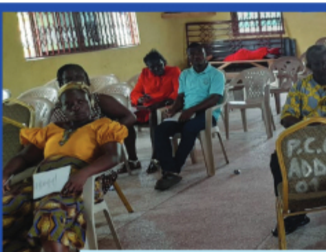
Ada Refresher Teacher Training Workshop