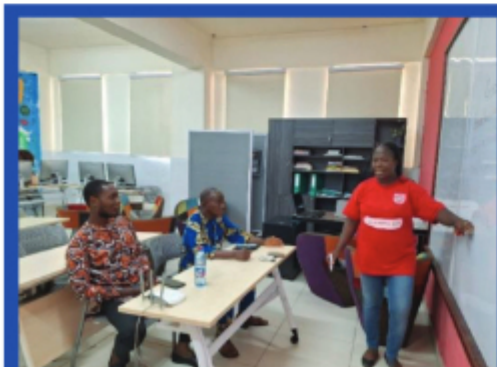
Benin team's visit to a language center