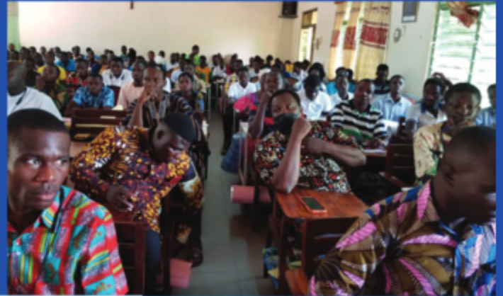
Konkomba TTW at Yendi