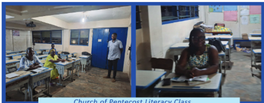
Church of Pentecost Literacy Class

A fruitful review meeting on 31 March with one of our major partners, the Church of Pentecost (COP) culminated with a decision to jointly organize a Teacher Training Workshop for Konkomba language speakers in July. Teachers trained will in turn teach about two thousand non-literate Konkomba speakers within the COP throughout the country.