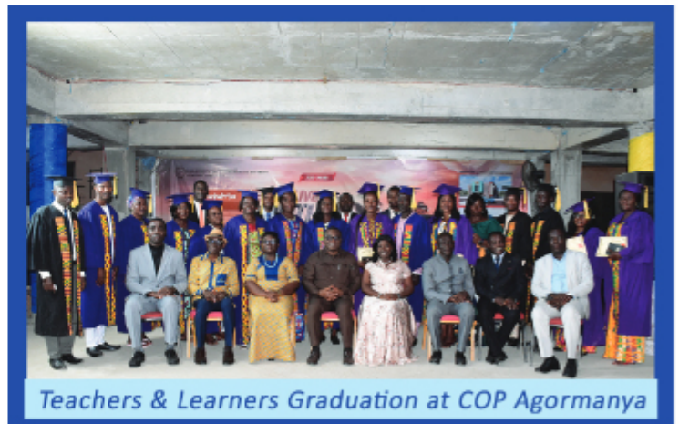
Teachers & Learners Graduation at COP Agormanya

We visited the PCG Resurrection Preaching Point at Abola, Accra on Sunday August 17 to ascertain how their Ga literacy class was progressing. We noticed the literacy class was progressing well under the able leadership of the teachers and the Caretaker leaders of the preaching Point.