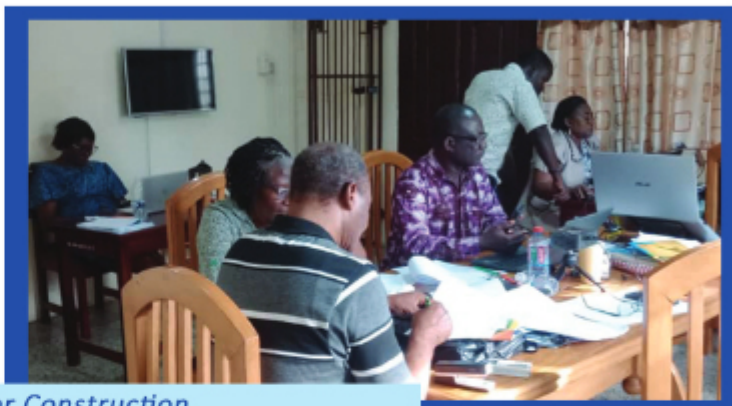
Okere Primer Construction