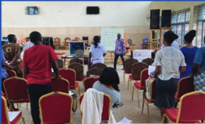
Kpong & Agormanya Teacher Training Workshop