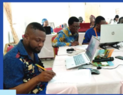
Primer Construction Workshop at Abokobi