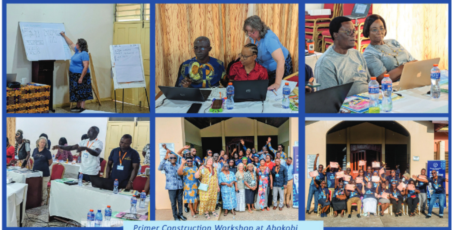
Primer Construction Workshop at Abokobi

The PCW at Abokobi continued to Thursday October 16 when the closing ceremony was performed. Participants departed the Presbyterian Women's Center, Abokobi on October 17, 2025. We thank God for the testimonies from the Participants of the impact on their lives and important skills acquired in Primer construction.