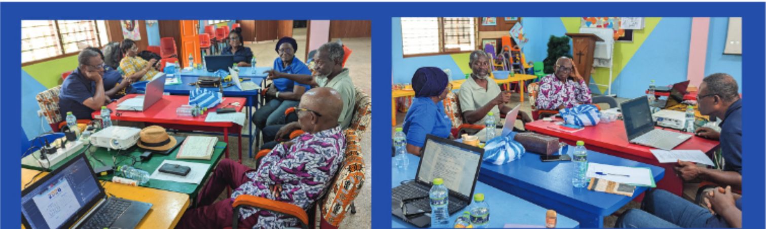
2025 Management Retreat

We also had our Annual Planning Meetings over a two-day period to plan for 2026.