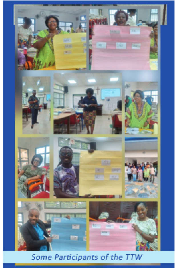
Some Participants of the TTW

We also organized a Teacher Training Workshop (TTW) for the Trinity United Church and the Presbyterian Church of Ghana, Resurrection Congregation at the Trinity United Church on the Trinity Seminary campus, Legon from June 18-21. A total of Thirteen (13) Participants took part in the training. The team work was wonderful!