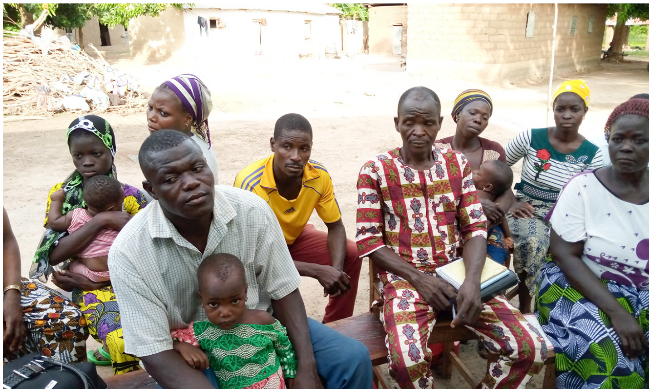
Visit to the literacy centers