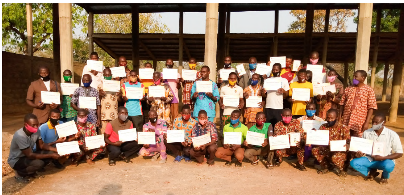
Picture of the presentation of certificates to pastors and members of the Lokpa literacy office

The first three (3) months of 2021 were devoted to the preparation and training of the actors of the literacy campaign. These actors, who are in fact evangelists or pastors and literacy teachers, made up two teams, one for Lokpa language speakers and the other for Yom language speakers. The Lokpa team of 57 participants was trained in February in the village of Gaounga and the Yom team of 45 participants was trained in March in the city of Djougou. The objective of these trainings was to provide the actors with the tools and knowledge necessary for the proper conduct of the literacy campaign.