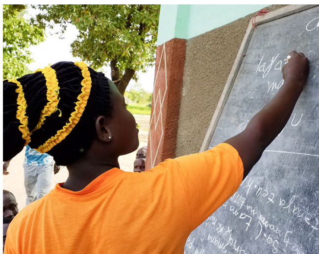
Evaluation of learners in the village of Bantoko

The methodology consisted in proposing assessment tests in four disciplines, namely writing, arithmetic, dictation and oral reading, taking into account the level of each center. These tests were administered to learners in each center. One day was set aside per center for the evaluation. At the end of the day, the literacy teacher and the project manager were responsible for correcting and announcing the results. It should be noted that each learner wrote in his or her own place of training.