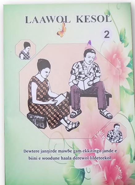
Fulani primers, Book 1 & Book 2