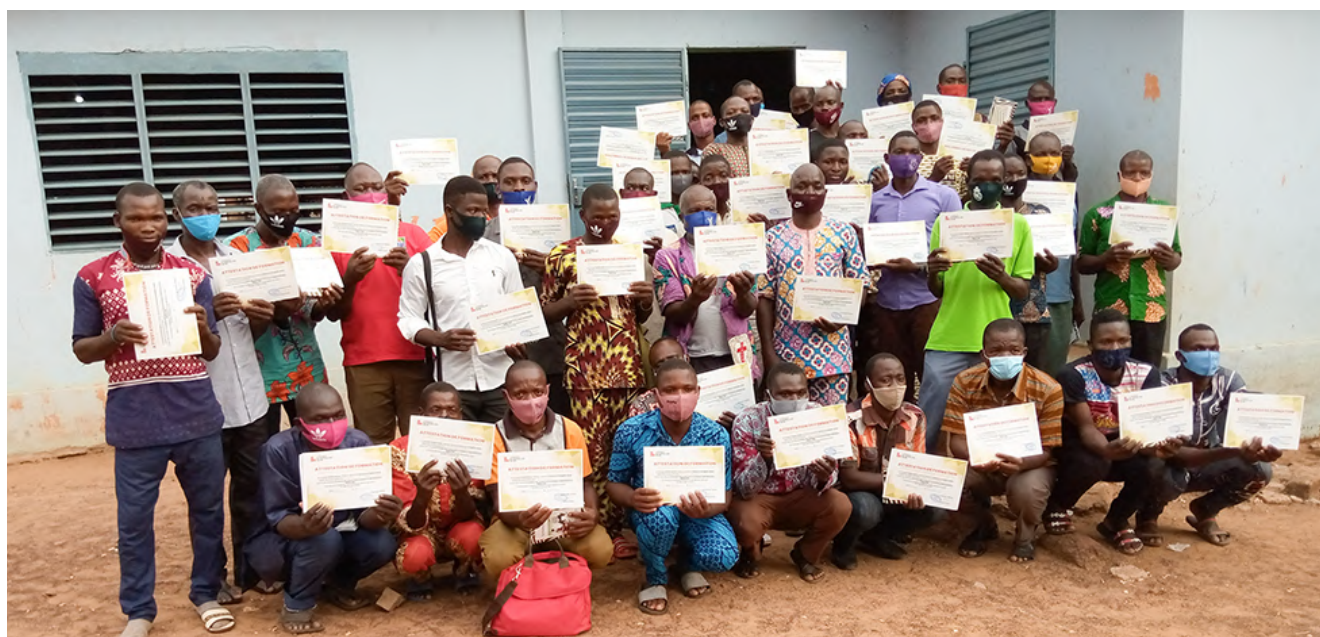
Picture of the presentation of certificates to pastors and members of the YOM literacy office