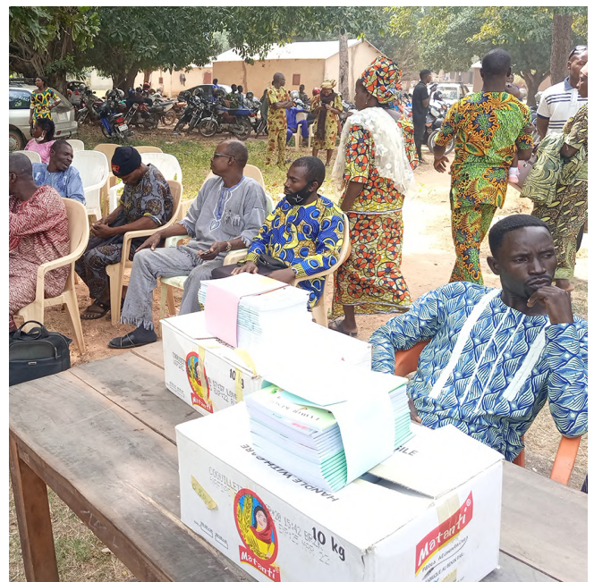
Distribution of the Fulani primers in the forecourt of the Evangelical Church of Boukoussera