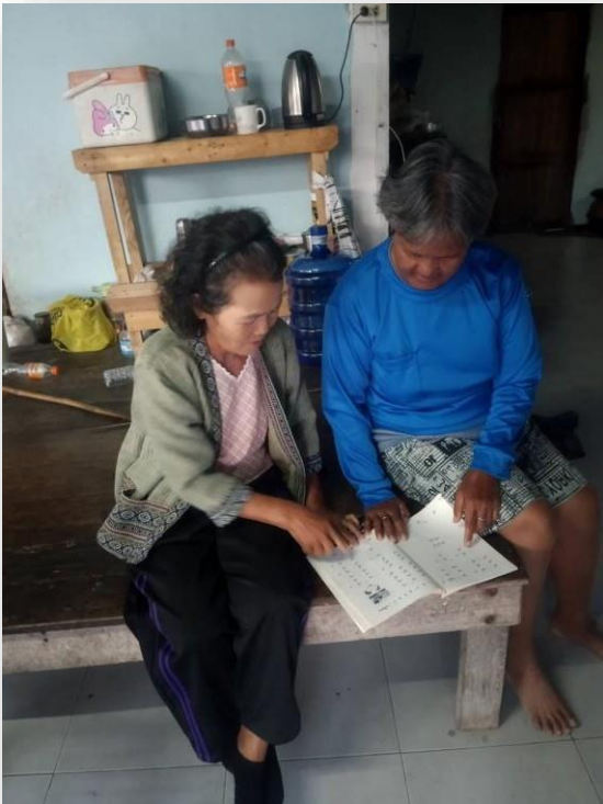
She is teaching her illiterate neighbor.