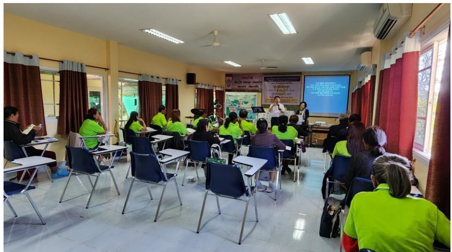
The seminary students participated hard for four days.