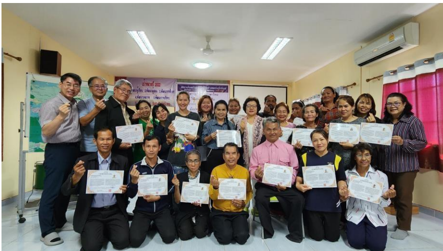
Fourteen seminarians completed the course.