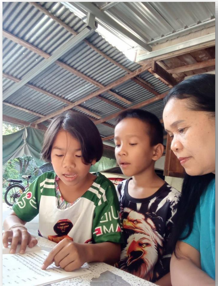
She teaches the children regularly.