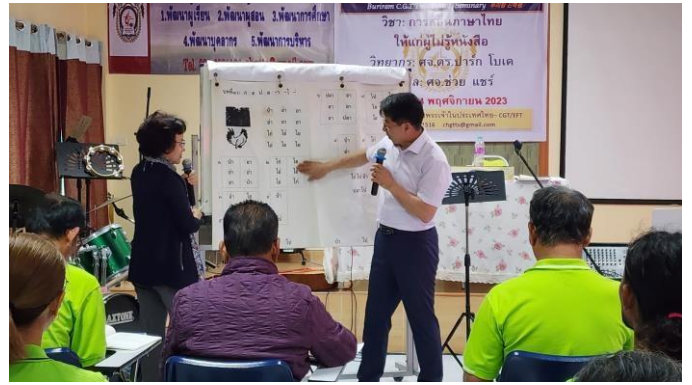
Reading guidance training