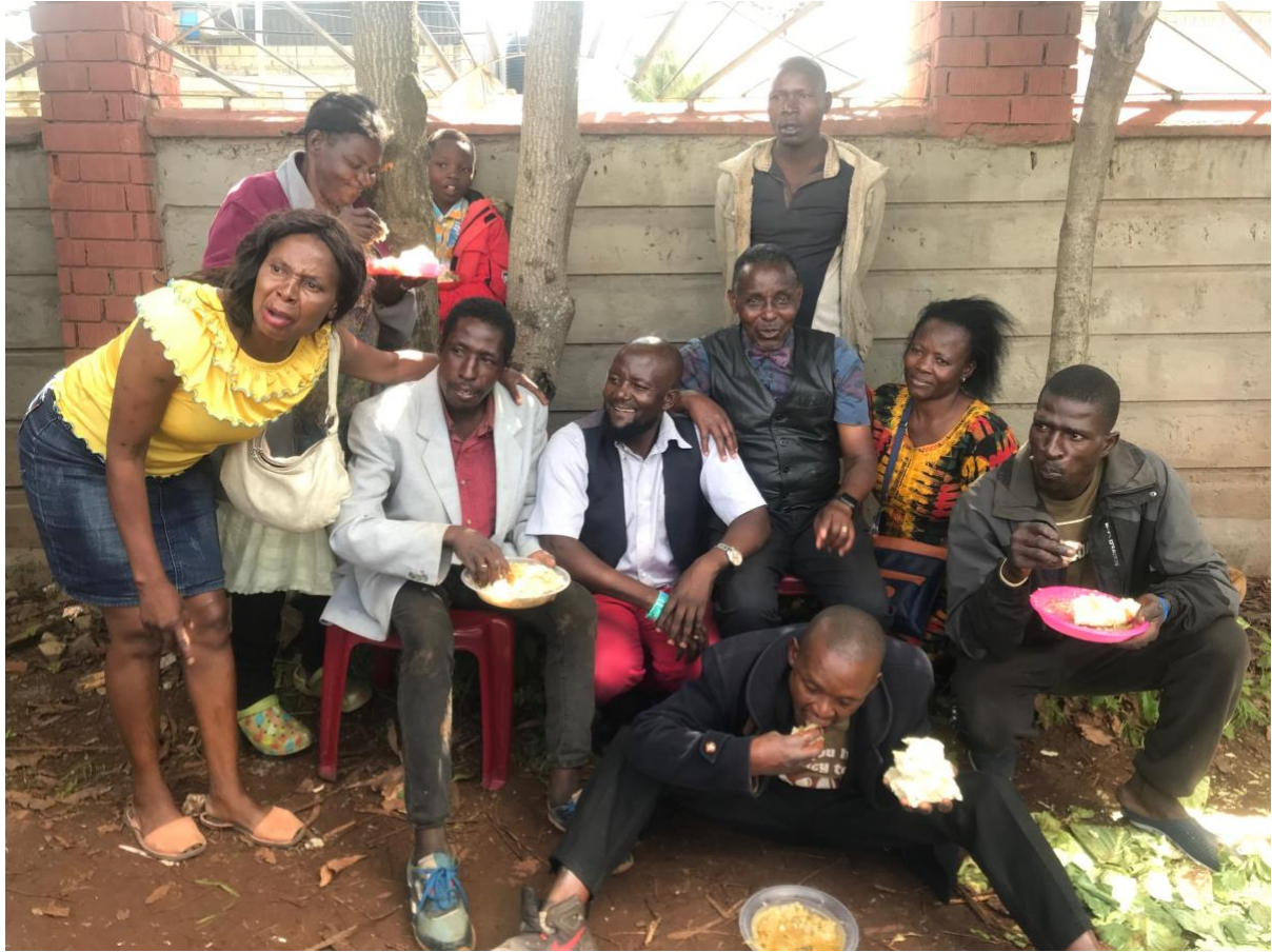
Christmas feast for beneficiaries of the Street Families Initiative