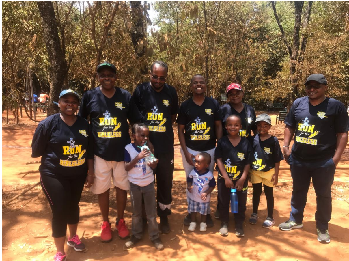
Team L&E at the Run for the Bibleless 2023

We again joined one of our best supporters: Bible Translation & Literacy in raising funds for Bible literacy in local languages. During the “ Run for The Bibleless 2023 ” event we were able to raise $ 1,265. Thanks to LEI for $1,500 the matching funds which enabled us to revise and print our Swahili primer: kumekucha