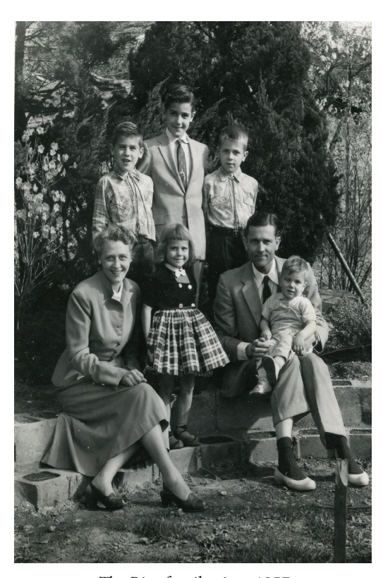
The Rice family circa 1957