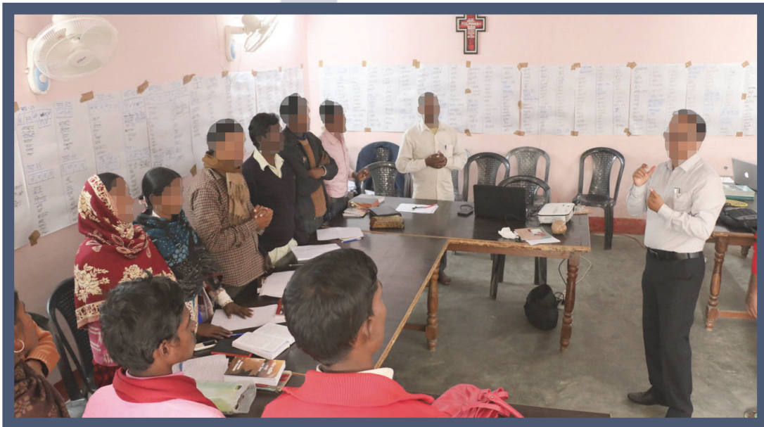
Primer Construction and Teacher Training Workshop

We are thankful for the success of these three important events. We look forward to 2018 to discover the multiplication effect of these new teachers and literacy materials, as the gift of literacy is shared with love.