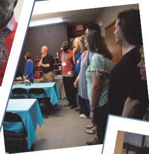
Food & Fellowship