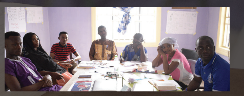
Epie Language Primer Construction

Bible translation and literacy instruction go hand in hand. Once a Bible translation is completed in an indigenous language, the next step is to teach the illiterate how to read it. This need creates a great opportunity for