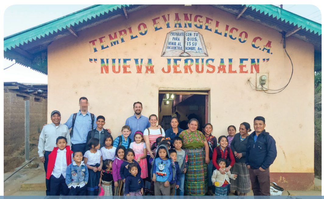
Short-term mission team from Beach Haven, New Jersey, with Island Baptist Church in Guatemala

These and countless others have shared the message of Jesus Christ by sharing the gift of reading - locally, nationally, and internationally. Is our Lord calling you to Literacy & Evangelism ministry?